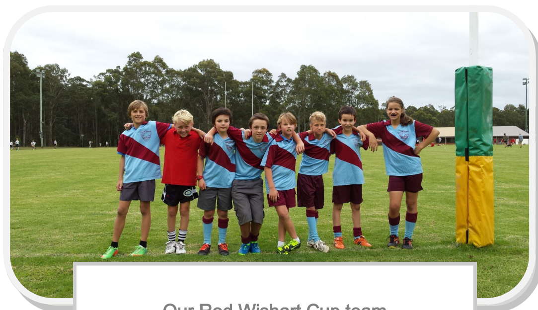
Our Rod Wishart Cup team