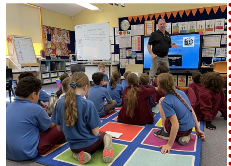
Learning about Film Making