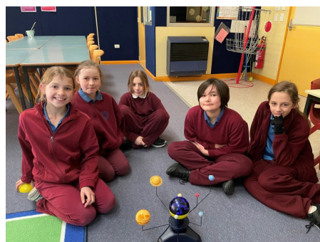
Learning about the solar system